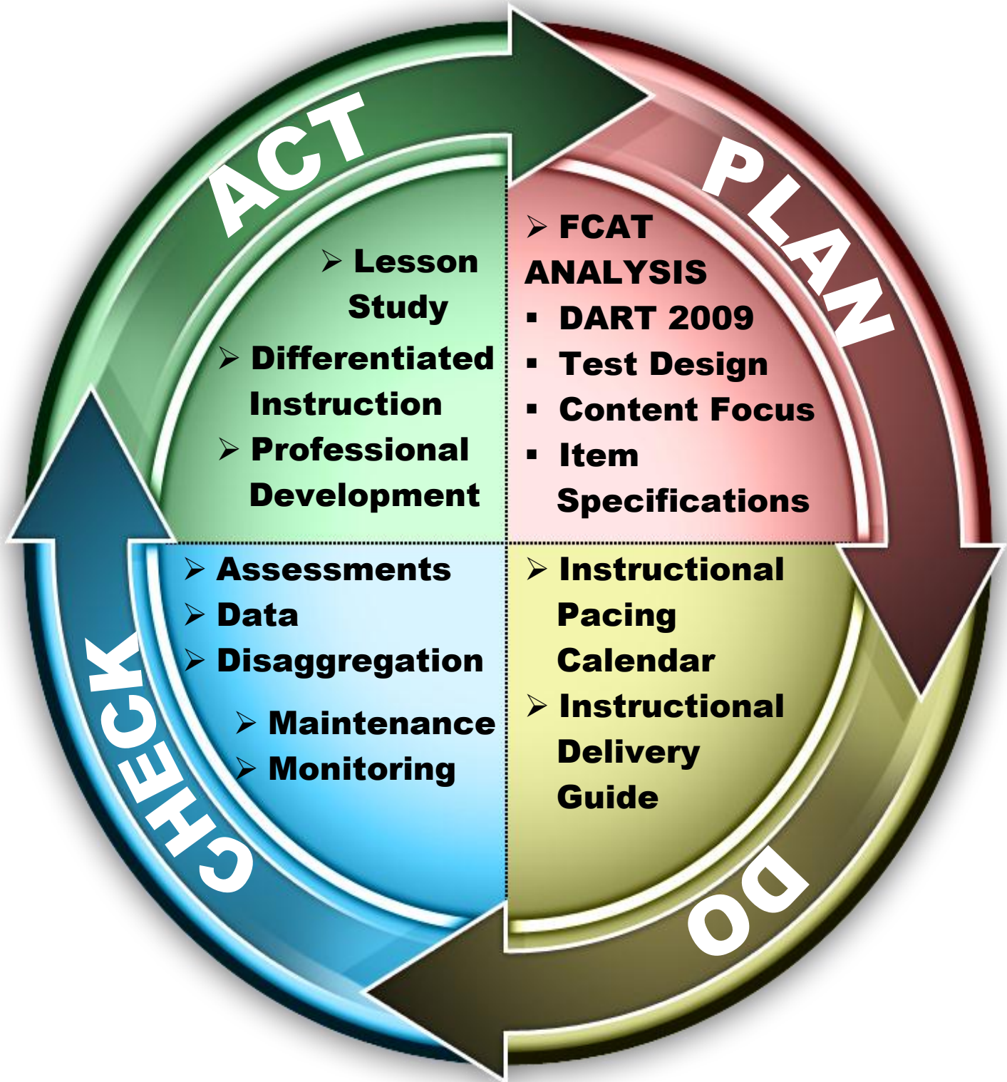
Continuous Improvement Model (2009-2010)